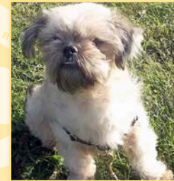
Chi Chi - NECC