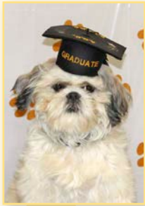
Camo - ACC