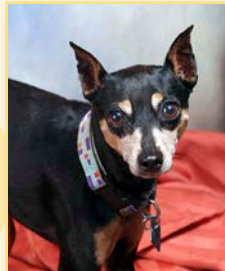
Ginger - ERDCC