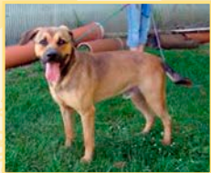
Spud - CRCC