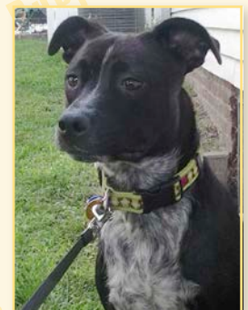
Ana - WRDCC