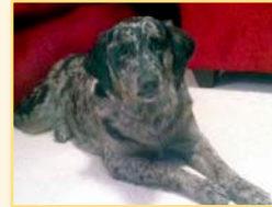
Darby - PCC