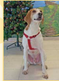
Cadbury - MTC