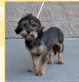
Jeorgia - WMCC