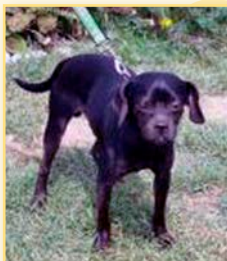
Cole - MCC