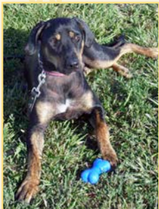
Taffie - JCCC