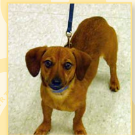
Poppy - SECC