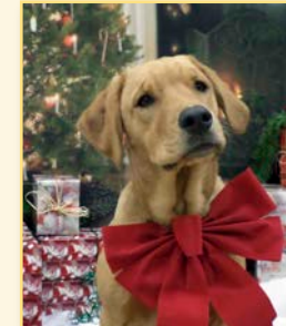
Sam - SCCC