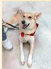
Mya - FCC