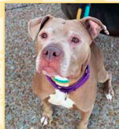
Crab Rangoon - MECC