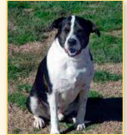
Brutus - OCC