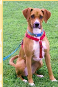
Dawn - CCC