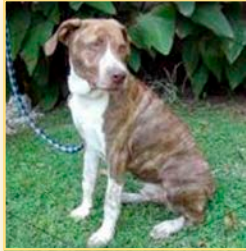
Tiger - BCC