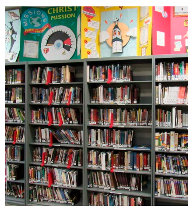
Chapel library at a correctional center