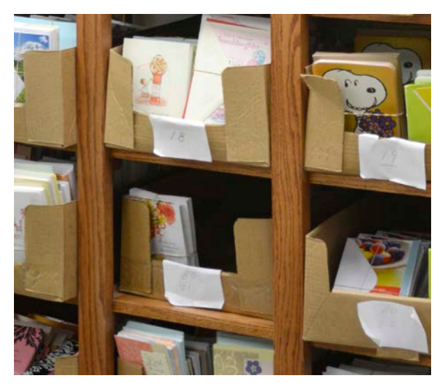
Donated unused greeting cards available to offenders