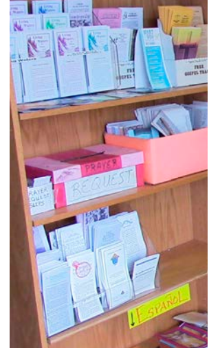
Free literature is available