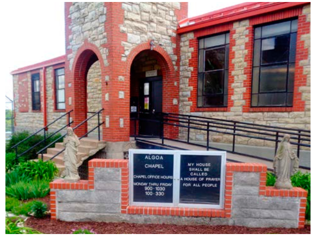
Chapel at Algoa Correctional Center

Many offenders are eager to re-evaluate faith principles because they realize their self-seeking strategy has failed them. Chaplains and chapel programs challenge offenders to address spiritual issues, questions and needs by introducing them to spiritual programming offered within a correctional environment.